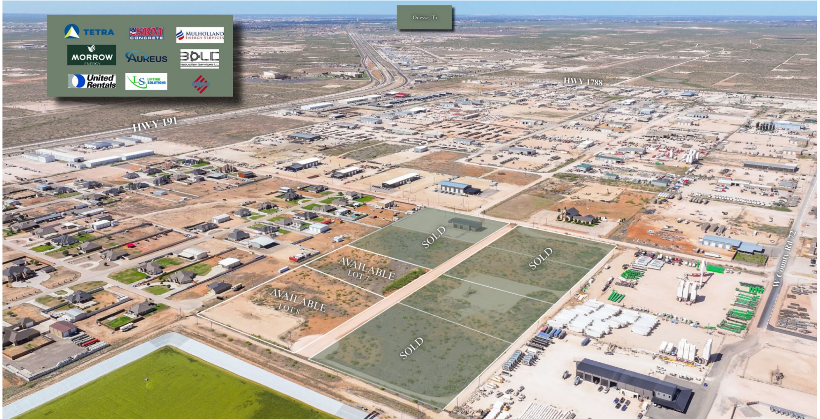
TBD W County Rd 1280, Midland Tx 79707