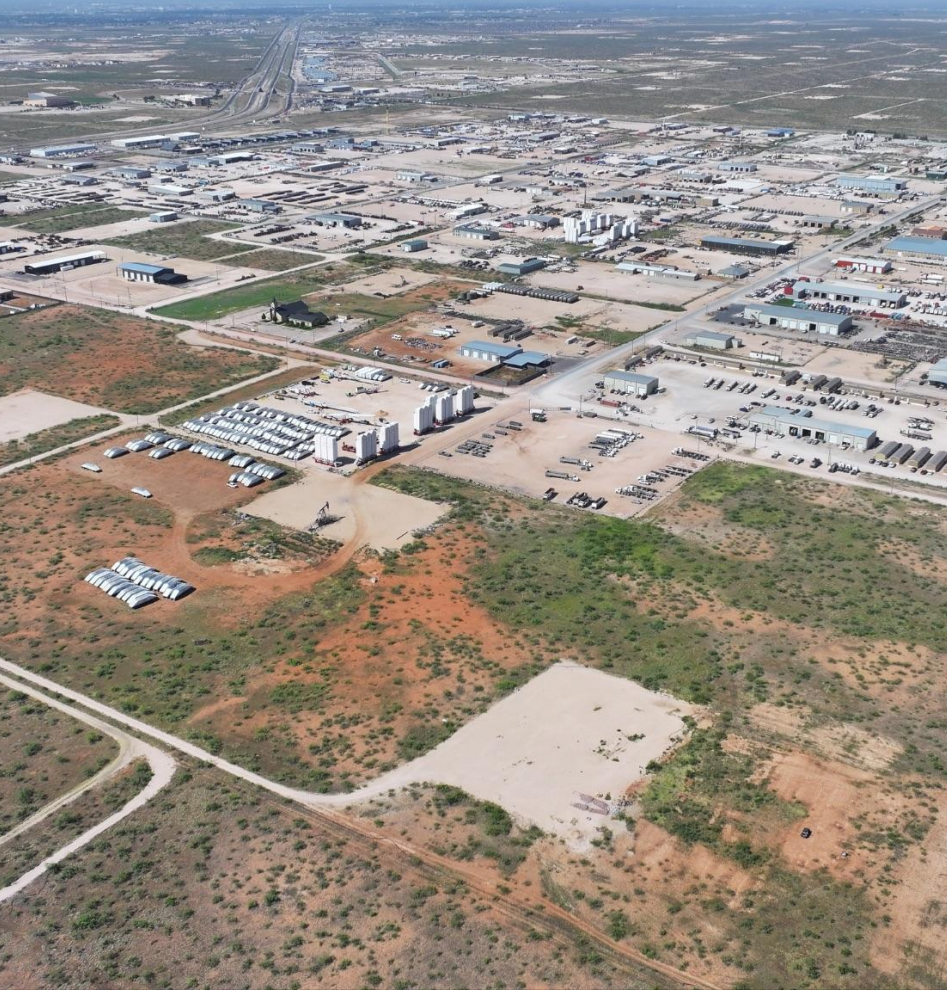
TBD W County Rd 72 | Midland, TX 79707 www.investtexas.com