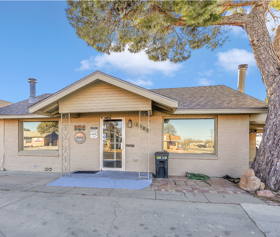
1509 N Big Spring Midland, TX 79701 www.investtexas.com