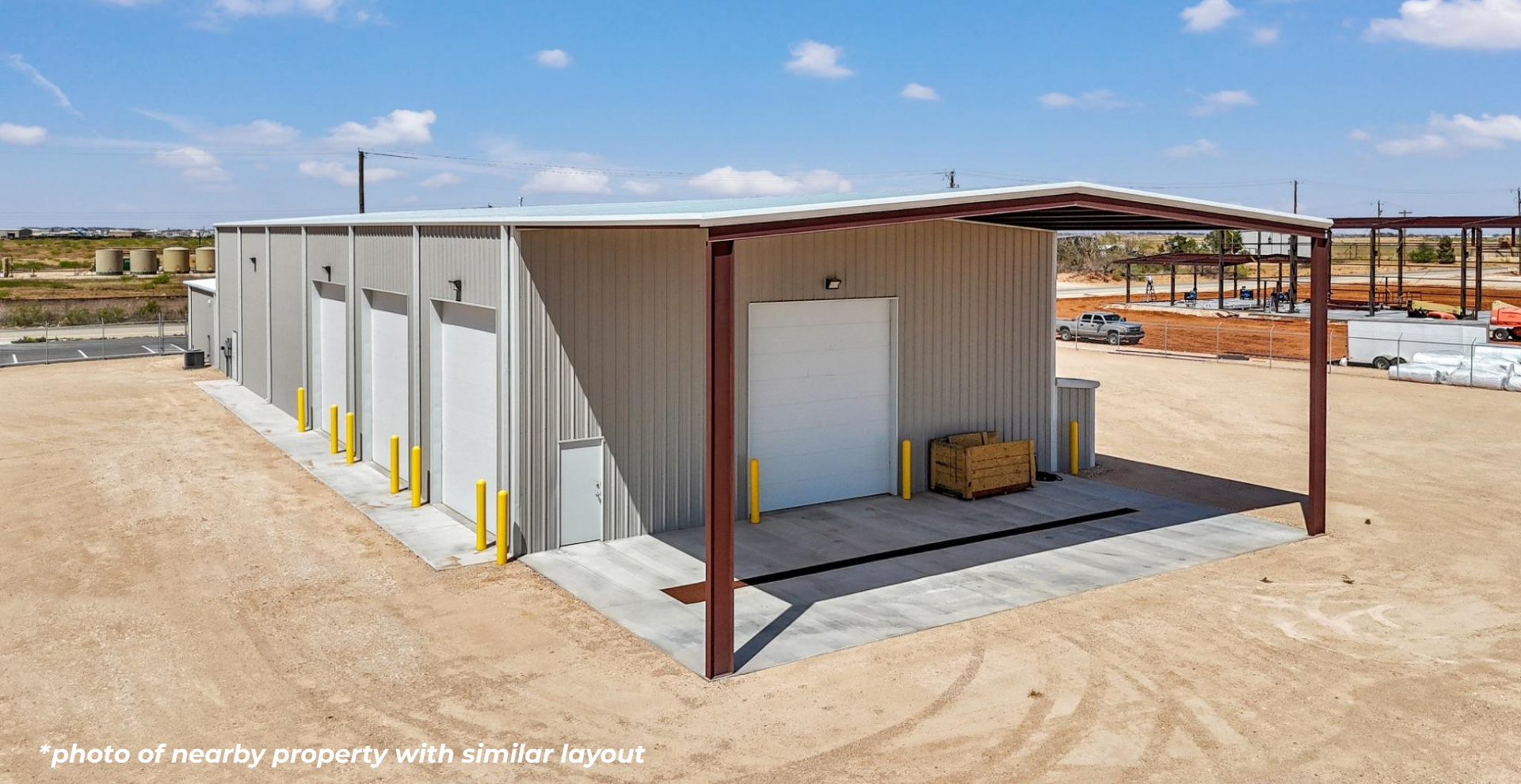
*photo of nearby property with similar layout