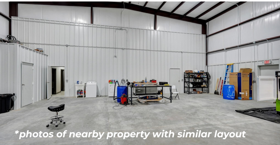
*photos of nearby property with similar layout