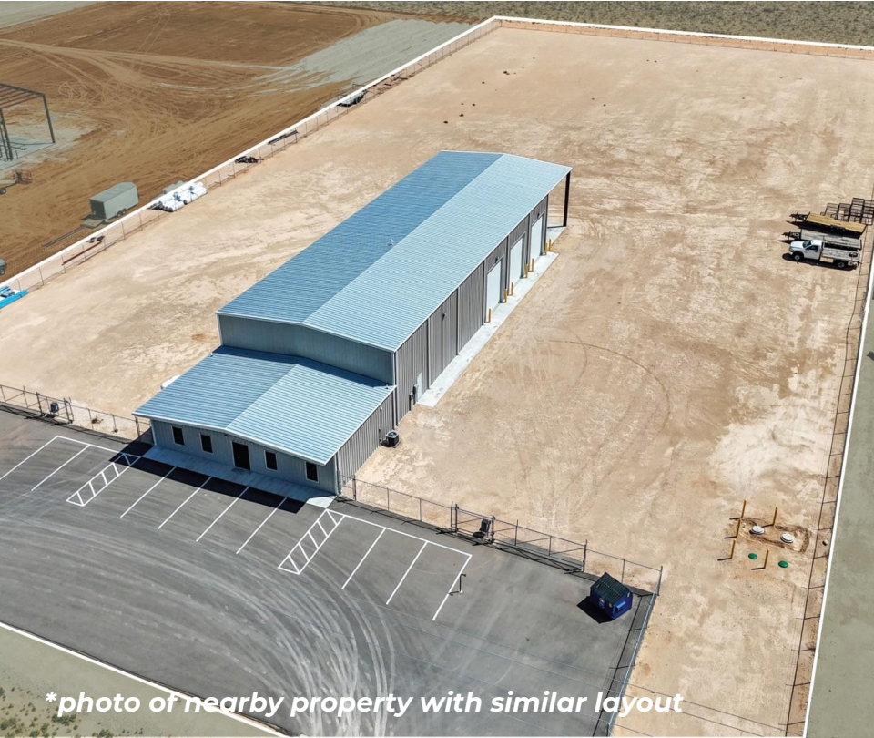
*photo of nearby property with similar layout