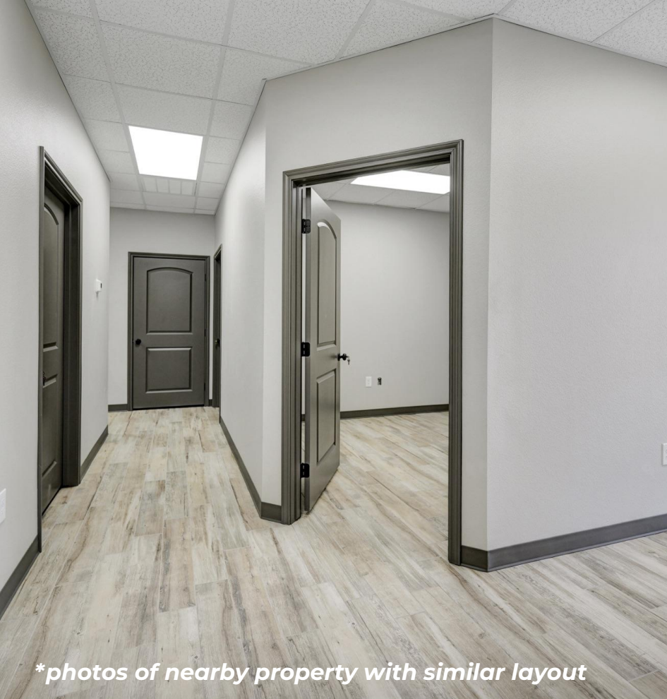
*photos of nearby property with similar layout