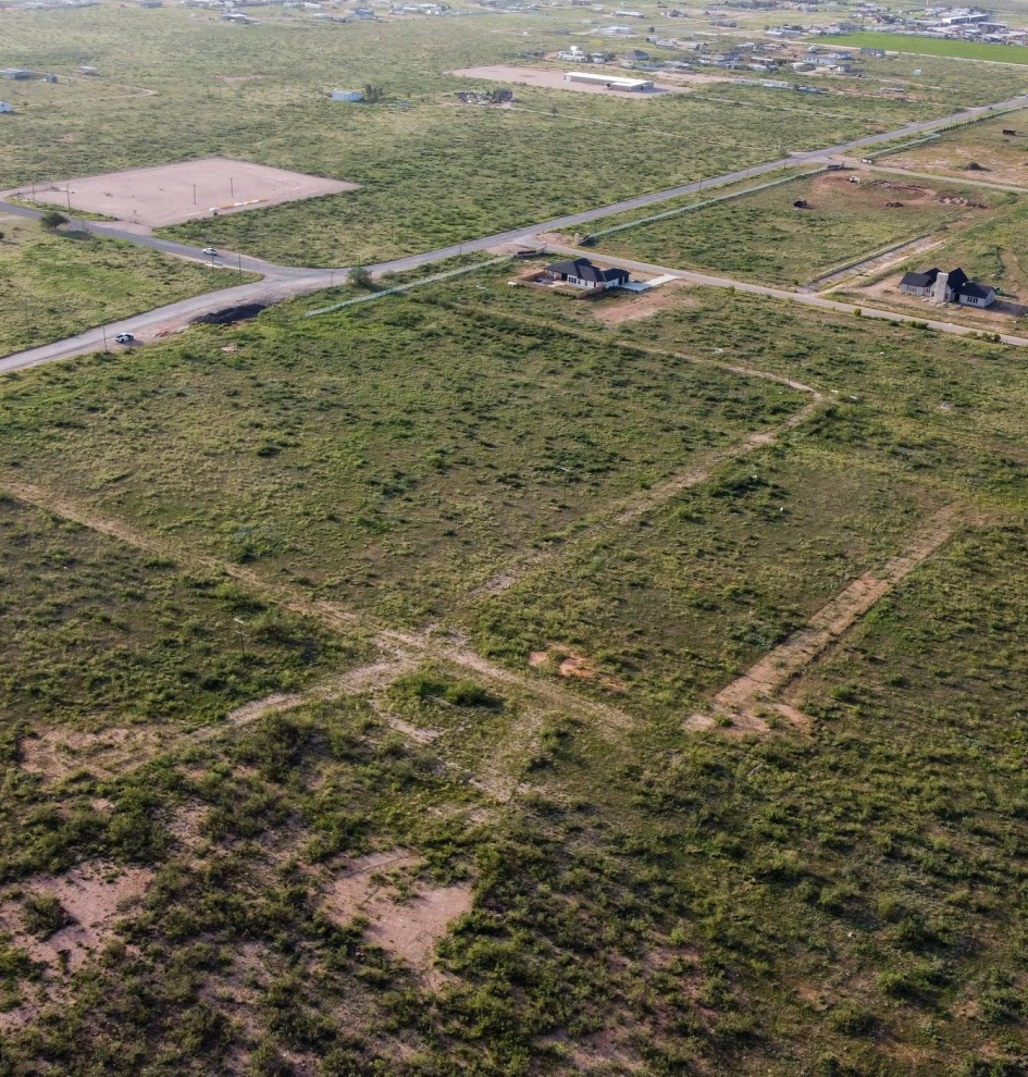
TBD NCR 1150 STANTON, TX 79782