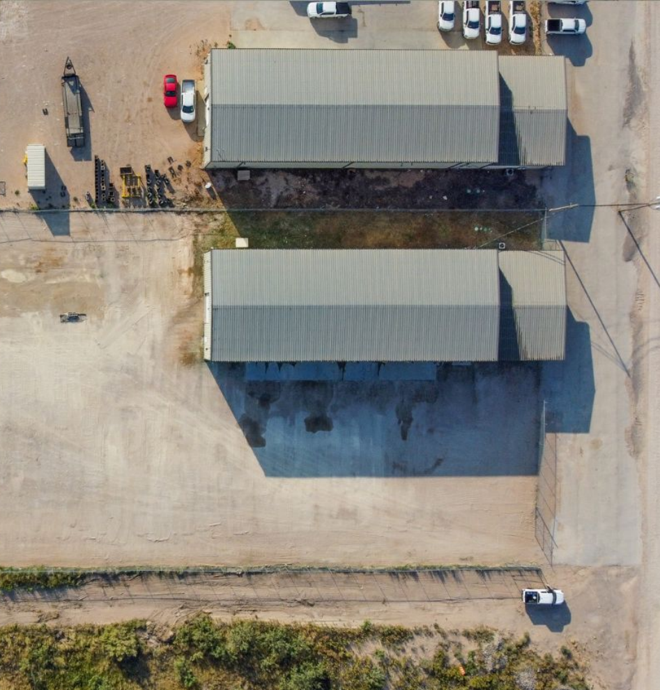
1509 S County Rd 1309 Midland, TX 79707