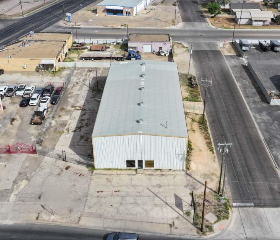
1900 W 2nd St Odessa, TX 79763