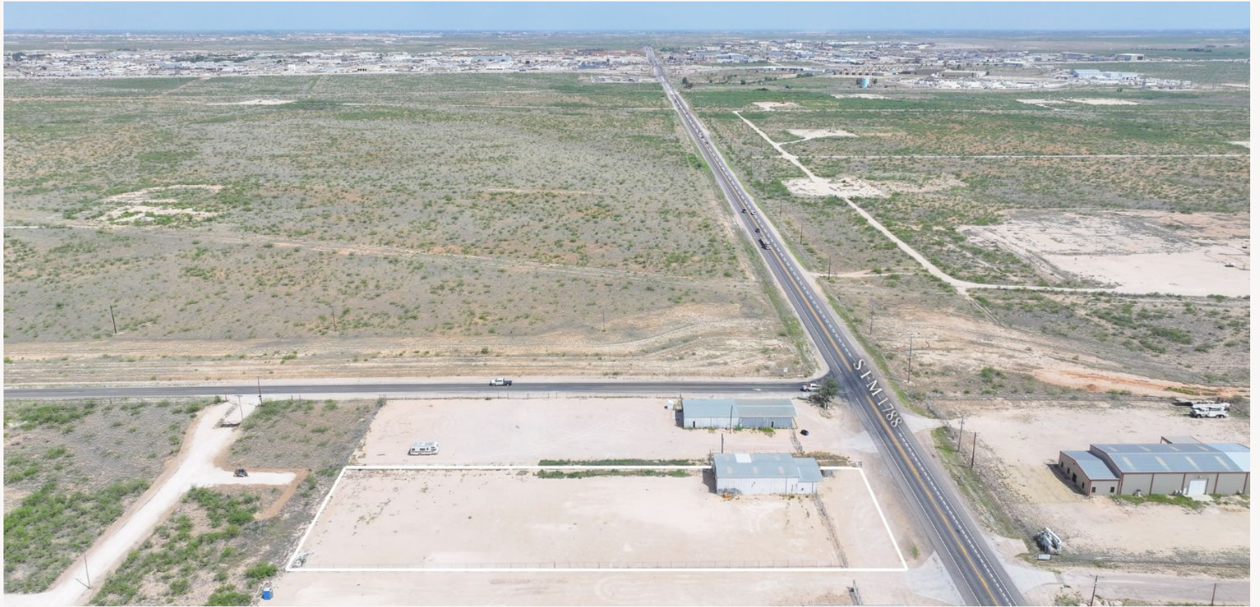
5508 S FM 1788 Midland, TX 79705