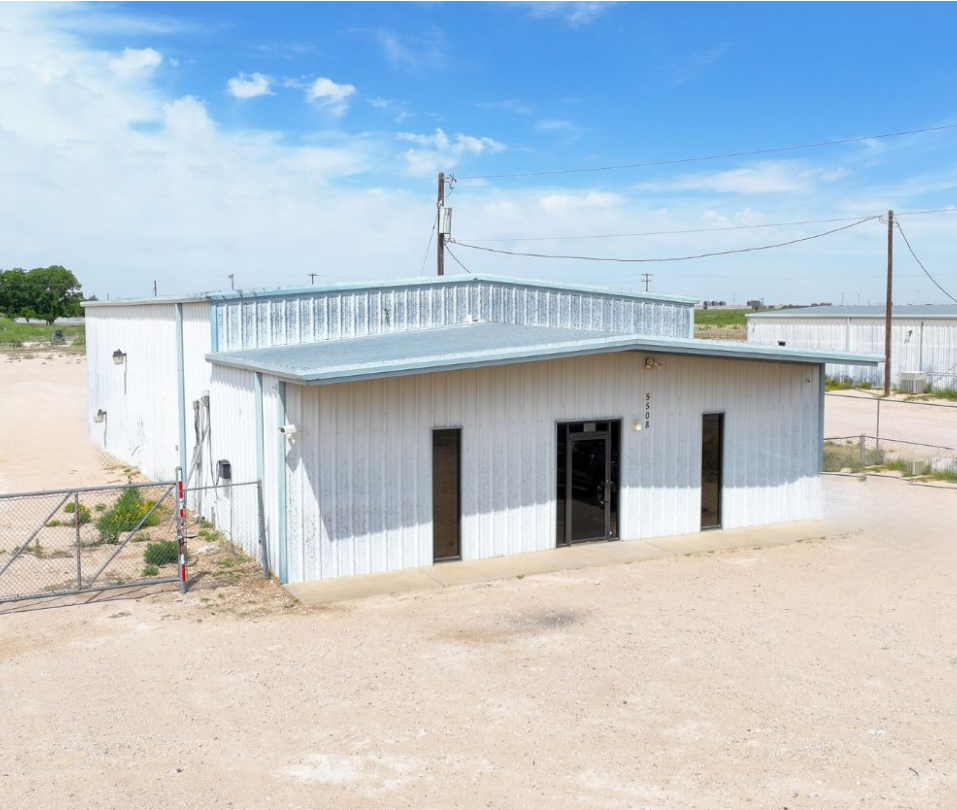
5508 S FM 1788 Midland, TX 79705